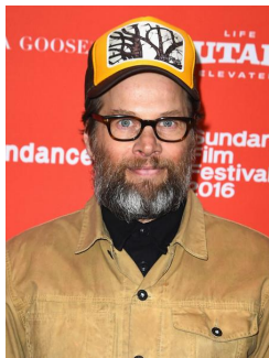
JAMES LE GROS as William Templeton

Since being cast in DRUGSTORE COWBOY , James Le Gros has established himself as a versatile actor with a diverse body of on-screen work.